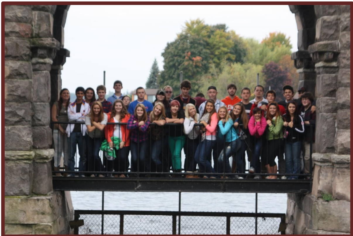
Sackets Harbor Central Graduating Class of 2013

Sackets Harbor Central welcomes all new families to the region and wish you well as you adjust to our rather long winters, invigorating spring, incredibly beautiful summers, and the changing of the season into fall. WELCOME!